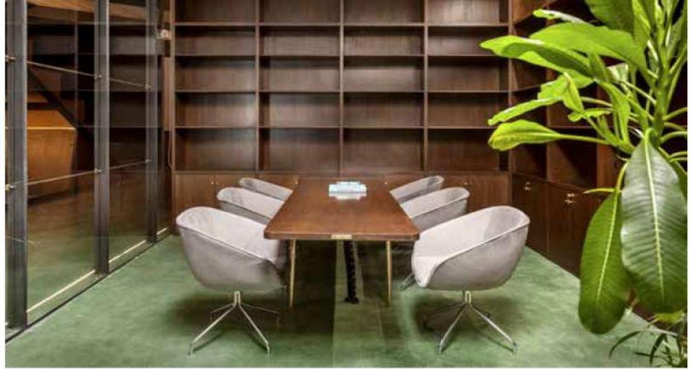
common room, new delhi | architecture discipline, new delhi