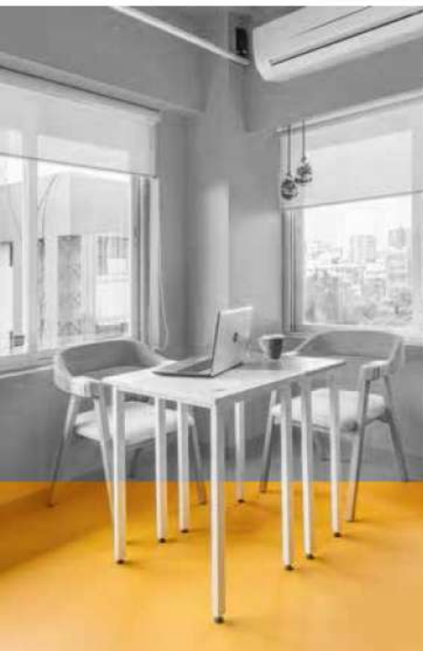
ensotique office, mumbai | hipcouch, mumbai

A dynamic space, the agile office offers more with less. Ar. Bhagwagar says, "An agile office will have 20 per cent fewer workstations than a normal office; it will also have almost twice the number of typologies of workspace than a normal office. Agile offices need to cater to a varying demand of work types and thus need to offer a plethora of options such as: quiet work booths, sit-stand workstations, linear benching, and L-shaped stations for dual monitors. It is when the variety of options are available, that choice is available and true agility comes to the fore."