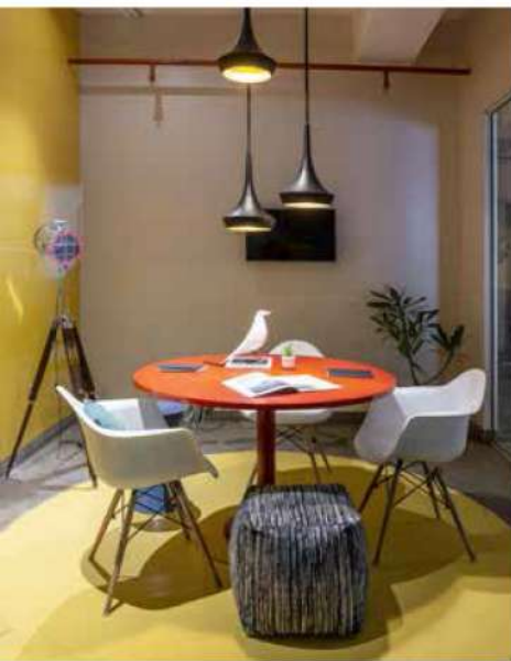
schbang office, mumbai | ashleys, mumbai