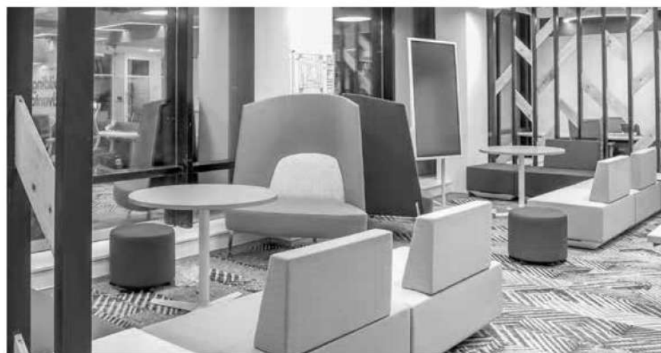
cbre office, gurgaon | ava design studio, new delhi & bengaluru