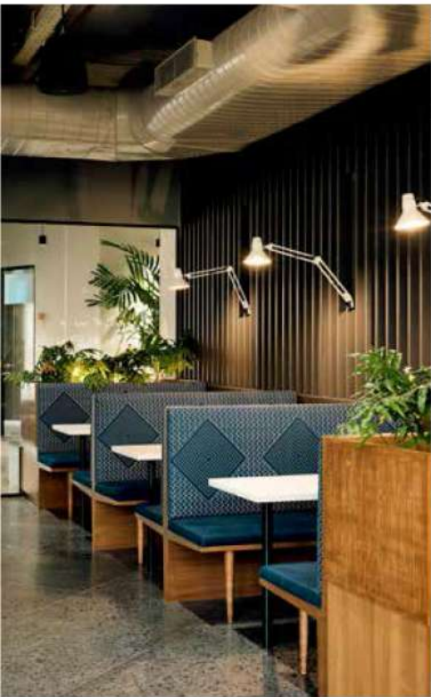
photography : : kafnu